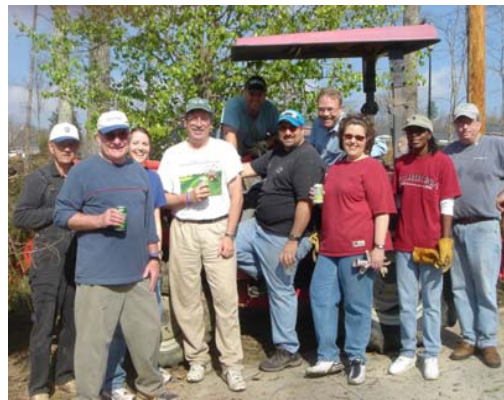
Club members enjoyed the Hallelujah House landscaping project!

Chartered on May 20, 1920, the club was instrumental in the establishment of the city's Parks & Recreation Dept., the YMCA, High Point University, and the Empty Stocking fund - now called the Christmas Cheer Fund.