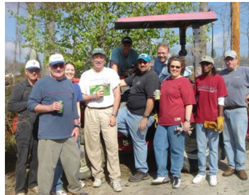
Club members enjoyed the Hallelujah House landscaping project!

Chartered on May 20, 1920, the club was instrumental in the establishment of the city's Parks & Recreation Dept., the YMCA, High Point University, and the Empty Stocking fund - now called the Christmas Cheer Fund.